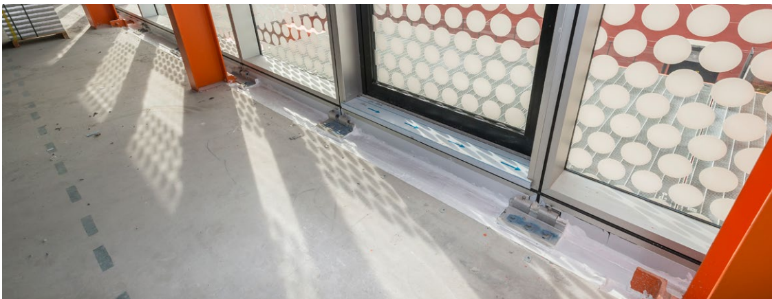
SoftSeal installed as a linear joint seal

*Linear Joints over 300mm wide can be accommodated, with the addition of steel Z brackets. For further information and advice on sizes or applications, please contact Rockwool Technical Solutions Team on 01656 862621.