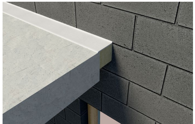
Linear joint seals